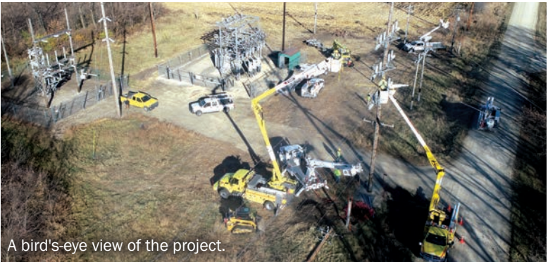
A bird's-eye view of the project.