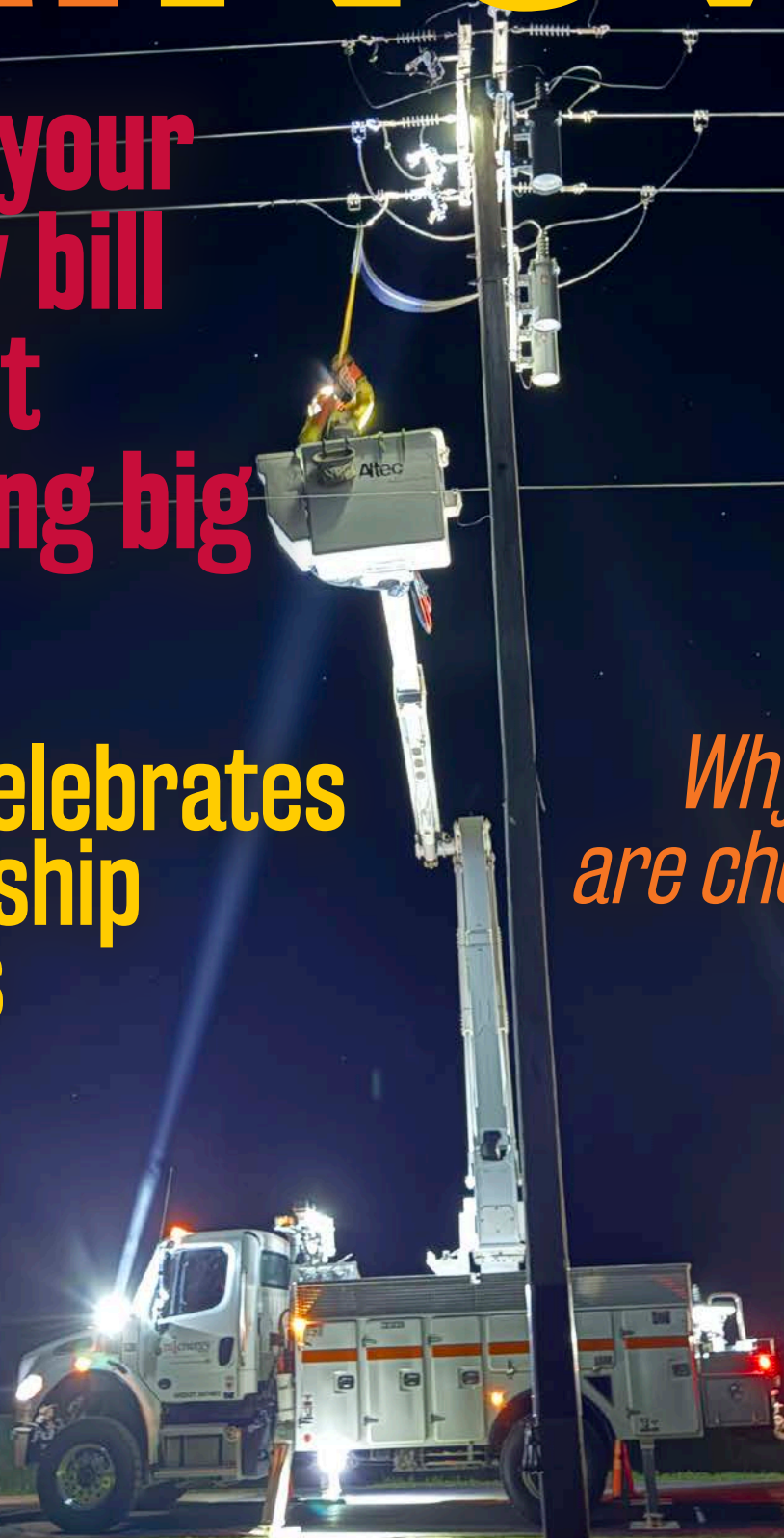
MiEnergy's Darrin Peterson (in the bucket) and Jamie Breaser (on the ground) are shown doing the work necessary to de-energize the city of Wykoff as part of a planned overnight power outage to replace five poles. In total, 24 lineworkers took part in the outage to remove deteriorated poles.